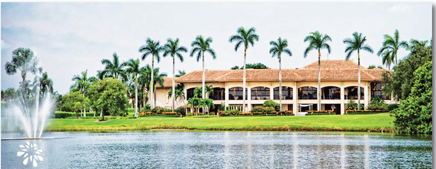
the Club at Boca Pointe